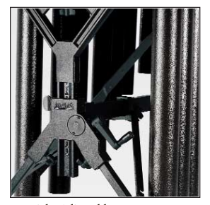
Height Adjustable Voyager Frame

Each of the resonator tubes below A2 on all Adams Artist Series Marimbas features an individual tuning control, allowing you to fine tune your resonators to adjust for any changes in humidity or temperature.