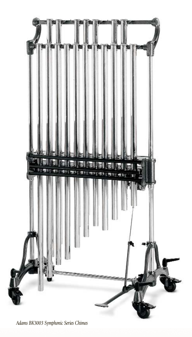
fter years of extensive research into the overall development, design and precision tuning of Tubular Bells, Adams chimes are considered by many to be the finest sounding, truly "in tune" chimes available on the market today. As part of this research, Adams engineers painstakingly perfected the optimum brass alloy for use with this fine instrument. This exclusive proprietary brass alloy gives all Adams Tubular Bells their beautiful tonal quality and unmistakable premium quality sound. Adams chimes are available in three distinct series, Standard, Symphonic, and the ultimate chime, the Philharmonic. Each series of Adams Chimes has been designed to offer the finest quality sound and construction available today within it's respective

The BK-2001 Standard Series Chimes feature our 1 inch diameter exclusive brass alloy tubes, stunningly chrome plated to a brilliant finish. Like all Adams Chimes our Standard Series Chime rack is fully height adjustable and features Adams two-way locking casters that when locked will not roll or turn, and an easy to operate, excellent foot pedal dampening system to quickly eliminate unwanted resonance.