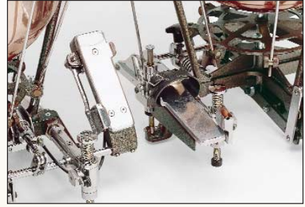
Our new Cloyd Duff Model Dresden style pedal (shown at left) and our Original Berlin Style Pedal (shown at right) both offer the exclusive Adams "ratchet free" adjustment system.

Both our original Berlin Style and our new Cloyd Duff Model Dresden Style Philharmonic Light models feature the exclusive Adams "ratchet free" adjustable pedal system. Often imitated, this unique system is state of the art, offering without doubt the best positive locking mechanism available. There are absolutely no intermeshing metal teeth, which can slip, grind and restrict the pinpointing of each note. With the Adams pedal mechanism, the player can lock in any note securely and silently, precisely where you hear it, not where the tooth of a ratchet dictates. Our new patented split rocker arm system, redistributes the leverage employed by the pedal cam and the fine tuner rod, thus eliminating the increased resistance in the pedal and fine tuner mechanism in the high register of each drum. This amazing design decreases the pressure on the frame of the timpani, preventing any flex or changes in the frame or bowl shape. The result is an