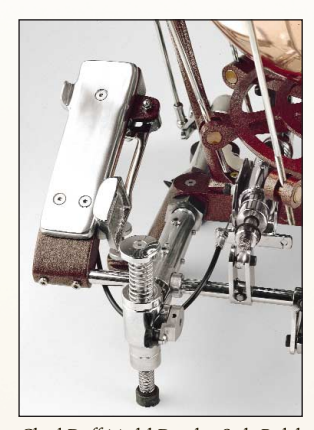
Cloyd Duff Model Dresden Style Pedal Our new Cloyd Duff Model Dresden Style Pedal offers the player preferring a foot controlled system, state of the art adjustment features and our exclusive spring balance mechanism to provide unsurpassed quality, functionality and dependability.

dams Philharmonic Light Timpani represent the ultimate expression of quality in tympani sound and design. Two distinct models are available, distinguished by a choice between our original Berlin style pedal, or our newly designed Cloyd Duff Model Dresden style pedal. Both designs feature the quality, engineering and state of the art precision that have become synonymous with all Adams instruments.