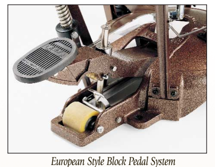
Our Symphonic Series pedal mechanism operates independently allowing you to change the pitch of the Timpani without affecting the feel and tension of the pedal. The pedal action remains smooth and precise, regardless of head tension

The Adams Symphonic Series Timpani are offered in five bowl diameters, 20", 23", 26", 29", and 32".