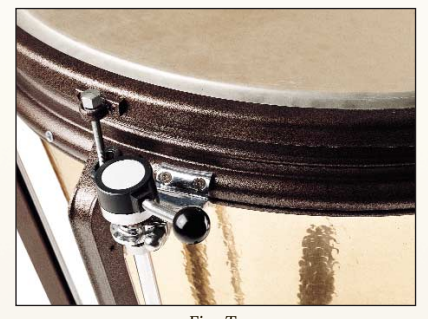
The Fine Tuner mechanism on all Symphonic Series Timpani is conveniently located to the players side and offers an extremely fluid, even movement for concise tuning adjustments

Hammered Seamless Bowls All Sysphonic Series bowls are seam free, formed from a silgle sheet of supreme quality copper and beautifully hammered to increase