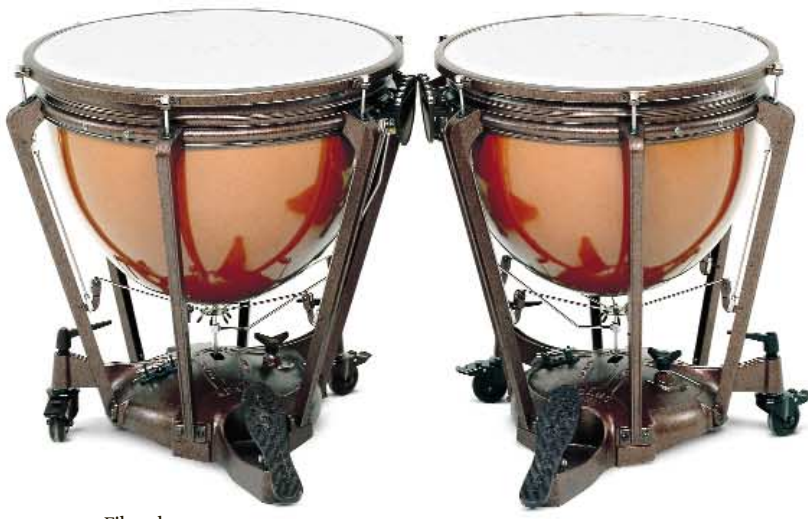
Fiberglass Professional Series Timpani

dams Professional Series Timpani offer a wide range of bowl configurations, and the perfect combination of exclusive features unmatched by the competition, and an unbelievably affordable price. With such an outstanding array of options, sizes and configurations available, from Junior High School Band to University Orchestra, there is a set of Professional Series timpani to perfectly fit your budget and performance needs. Simply put, Adams Professional Series Timpani represent the finest instruments available in this price range.