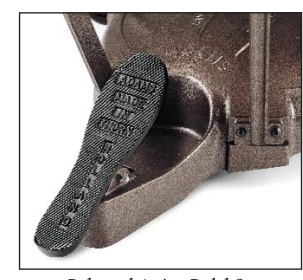
Balanced Action Pedal System Our balanced action pedal system provides an extremely smooth action without increased stiffness in the upper tuning register.