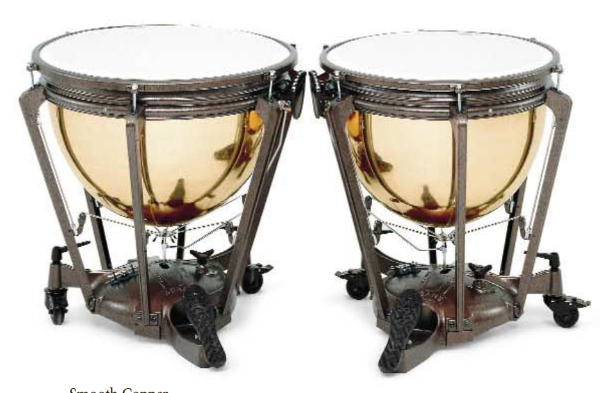
Smooth Copper Professional Series Timpani