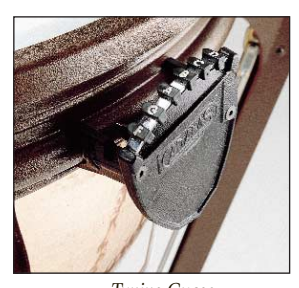
Tuning Guage All of our Professional Series Timpani offer an easy to read, precision engineered tuning guage.

All Professional Series Timpani provide two wheels at the rear, each custom designed with a braking mechanism that prevents the wheel from not only turning but also from rotating. The wheels are also custom designed to eliminate any possibility of noise from vibration. Other great standard features not found on timpani at this price point, include easy to operate tuning gauges and high quality Remo Custom Timpani heads with insert rings for increased rigidity and improved sound quality. Adams Professional Series Timpani are offered in five bowl diameters, 20″, 23″, 26″, 29″, and 32″.