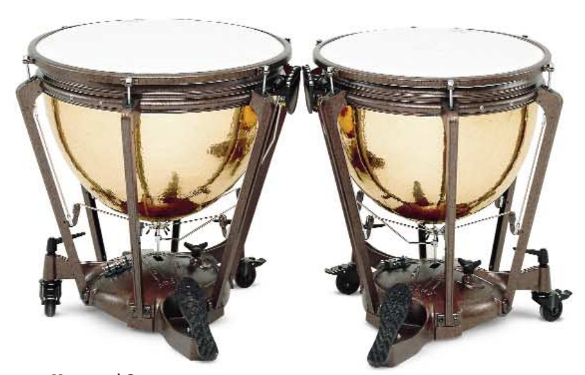
Hammered Copper Professional Series Timpani